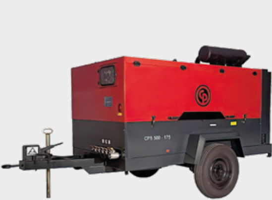
Portable Diesel Driven Compressor