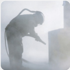
Visible Dust in Dry Blasting