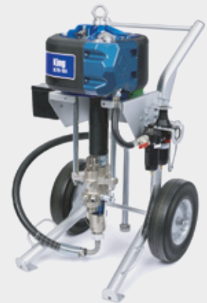
Graco King 70:1 Airless Spray Pump