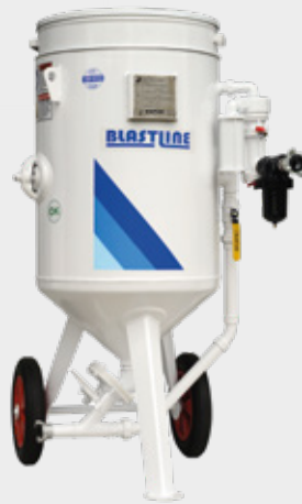
ASME 'U' Certified Blast Machine