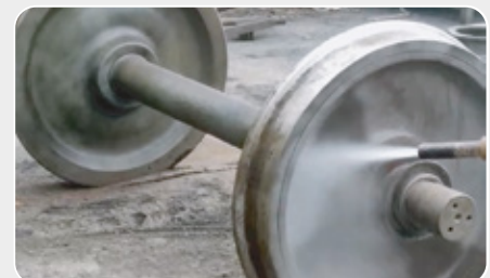
Rail Cart Blasting